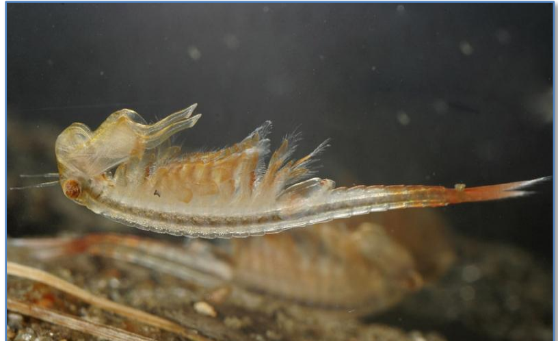
Vernal pool fairy shrimp—one of several special-status species with specific and critical habitat within the San Joaquin Valley ROW Maintenance EA project area.

The EA relied on a combination of existing data and data acquired through biological and cultural surveys conducted along the transmission line ROWs and associated access road ROWs. Resource areas evaluated are land use, habitats and vegetation, wildlife, special status species, fisheries, soils, air quality, water quality, public health, recreation, cultural resources, esthetics, and environmental justice. Noise is evaluated for its effects on wildlife and special-status species. Numerous special-status species are evaluated in the EA including the California tiger salamander, San Joaquin kit fox, the Valley elderberry longhorn beetle, and the Vernal pool fairy shrimp.